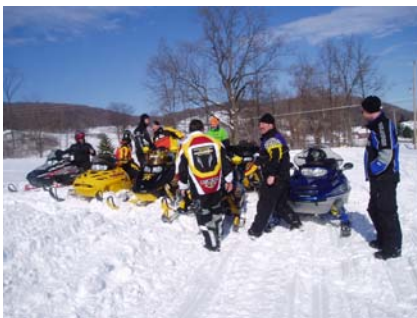
A nice afternoon of riding on the Saturday of the Poker Run. The sun was out; it was warm, who could ask for more